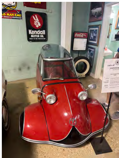
1956 Messerschmitt KR200

Some of our members had a wonderful time visiting The Cars Of Yesteryears collection.