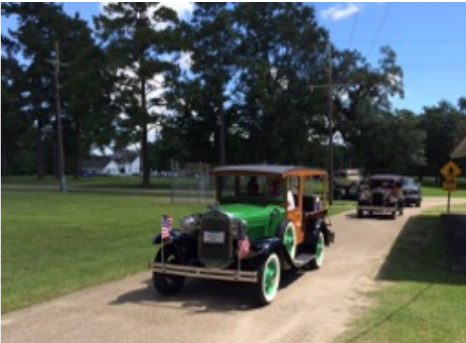
Arriving at the park